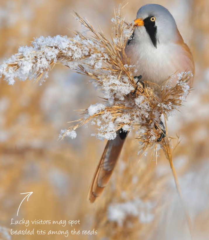
Lucky visitors may spot bearded tits among the reeds