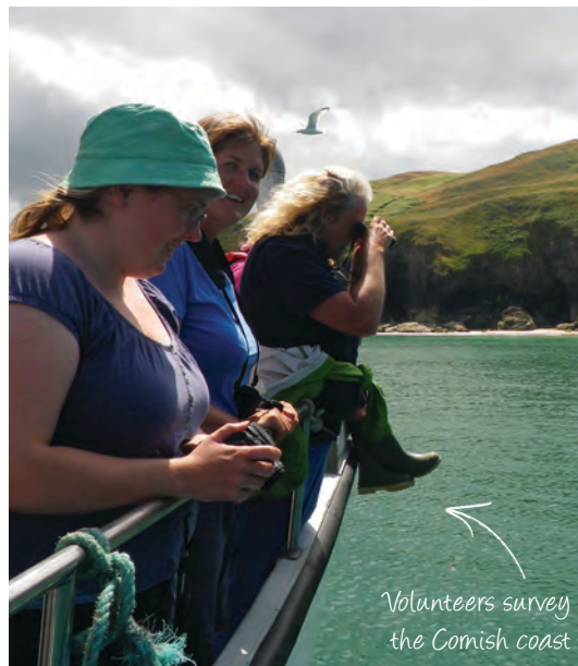
Volunteers survey the Cornish coast

Results from this project will give the Trust and ERCCIS a much greater understanding of the coastal ecology of North Cornwall. Data will be used to inform strategies to protect Cornwall's wildlife, help planners to consider wildlife within applications, and to manage invasive species. It will also be instrumental in providing evidence for proposed Marine Conservation Zones (MCZs). Currently under review by the government, MCZs are areas of the sea and shore that would be protected for generations to come – something The Wildlife Trusts are fighting hard for.