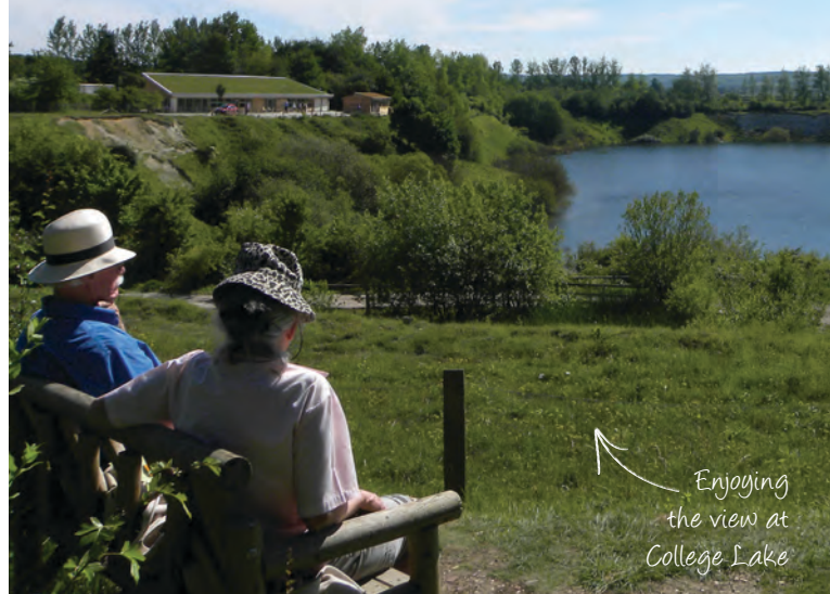
Enjoying the view at College Lake