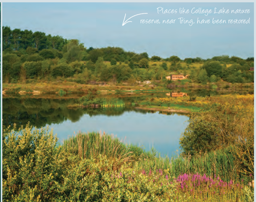
↖ Places like College Lake nature reserve, near Tring, have been restored