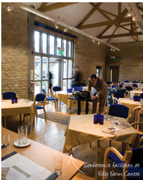
Conference facilities at Folly Farm Centre

The Trust aims to promote a better understanding of both wildlife and sustainable development within the community, so the buildings have been carefully restored using traditional construction practices and recycled materials. A range of measures have been installed to reduce energy consumption and treat waste water. All profits from the Centre (now a subsidiary company of AWT) are gift-aided to the Trust to support its work with local wildlife. Today, there are more than 5,500 visits a year.