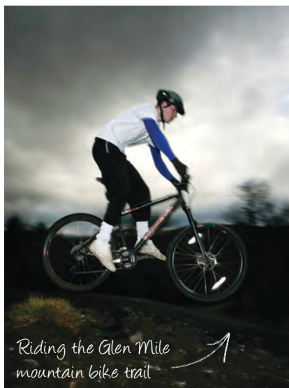
Riding the Glen Mile mountain bike trail

Popular with walkers and cyclists, the Cumbernauld Glen wildlife reserve lies in the heart of urban Cumbernauld. But the growth of informal mountain bike trails was damaging the woodland and causing conflict between the two users. So, with funding from Biffa Award and WREN, SWT has provided four purpose-built bike trails: one suitable for novices, children and all-terrain wheelchairs; and three more technically challenging trails for experienced riders.