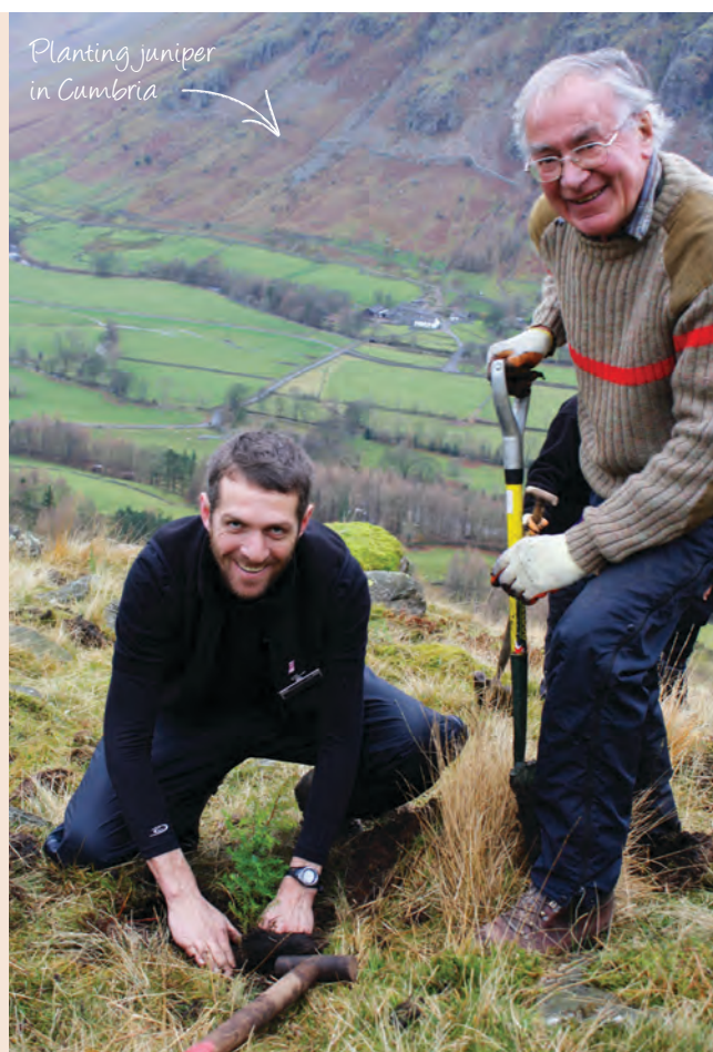
Planting juniper in Cumbria

Yet the survival of juniper in Cumbria is hanging in the balance as many upland areas suffer from overgrazing. With help from WREN and SITA Trust, CWT's Uplands for Juniper project aims to safeguard the future of this iconic plant through targeted survey and restoration work. More than 40 volunteers are involved in surveying 200 sites in the county, providing an up-to-date snapshot of the health of Cumbrian juniper. To help restore those areas in need of attention, more than 1,700 trees have already been planted. In addition, CWT is working in the wider landscape to encourage landowners to plant and manage juniper on their land.