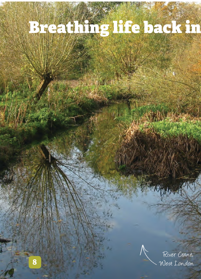
River Crane, West London

The scheme was given a boost recently when a three-year project, led by LWT and funded by Biffa Award, was completed. The project has enabled the Trust to restore an astonishing 8 km of habitat along the river through works like tree coppicing, planting vegetation, removing wooden bankside toe boards, and using brushwood bundles and gravels to narrow the modified channel and encourage natural river processes. Unfortunately, the hard work of LWT suffered a major setback at the end of 2011 when a devastating pollution incident killed thousands of fish and invertebrates. It made the project all the more important to help restore wildlife. Today, the river is on a sure path to recovery thanks to LWT and its partners.