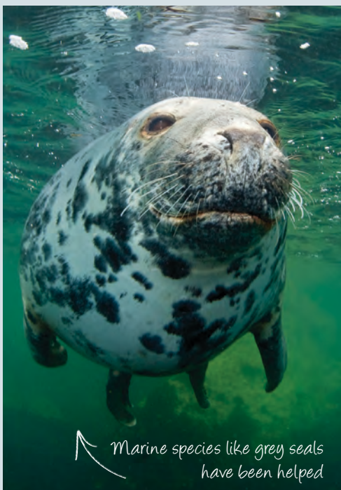
↖ Marine species like grey seals have been helped